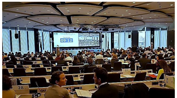
Bilateral meetings at de Gasperi room.