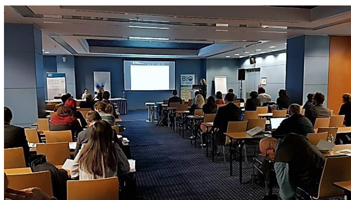
Sustainable Food Security (SFS) flash presentation session.